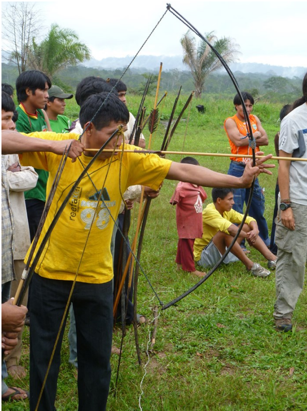
Figure 3 Tsimane' shooting a traditional bow and arrow.

for hunting compared with two advantages for firearms. Informants from both villages reached a consensus that gun-hunting is not better than traditional bow-hunting. Importantly, Tsimane' did not include game conservation as an emic concern regarding gun-hunting, contrasting with findings from ecological studies showing substantial game depletion with gun-hunting (Cronin et al. 2016; Kümpel et al. 2008; Levi et al. 2009, 2011; Peres 2000; Shepard et al. 2012). This lack of concern may be because these conservation effects are not yet readily observable. Based on comparisons of game offtake in gun- and bow-hunting communities in Peru, Alvard (1995) indicated that gun-hunting is not detrimental to game conservation. Reyes-Garcia (2001) reports similar offtake in gun- and bow-hunting intensive Tsimane' communities. However, comparison of kill rates upon encounter and return rates per hour for gun- and bow-hunting (Alvard and Kaplan 1991) suggests there may be lower game encounter rates in intensive gun-hunting areas indicative of reduced game biomass. Regarding Alvard's (1995) findings, Shepard et al. (2012:258) suggested that in 15 years after