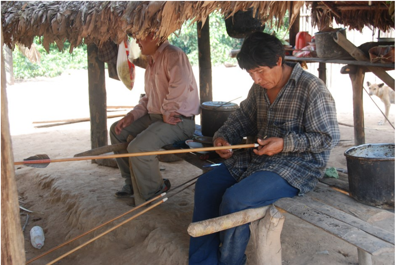
Figure 4 Finishing the fabrication of an Ijme', Tsimane' arrow to hunt small animals.

resulted in a substantial loss of indigenous knowledge for tool manufacture and hunting techniques. The quest for firearms has led Tsimane' into considerable debt they cannot afford in order to purchase guns and ammunition and to pay for repairs. This expense requires a shift from subsistence horticulture and hunting to production of surpluses for market sales. Widespread gun-hunting has also resulted in the loss of traditional skills acquisition through play with toy bows and arrows.