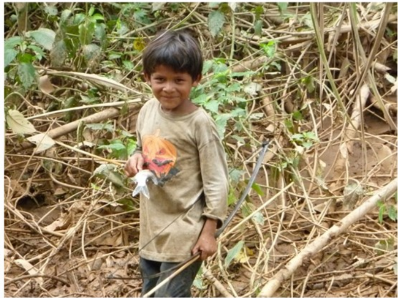
Figure 2 Right after successful fishing shots.