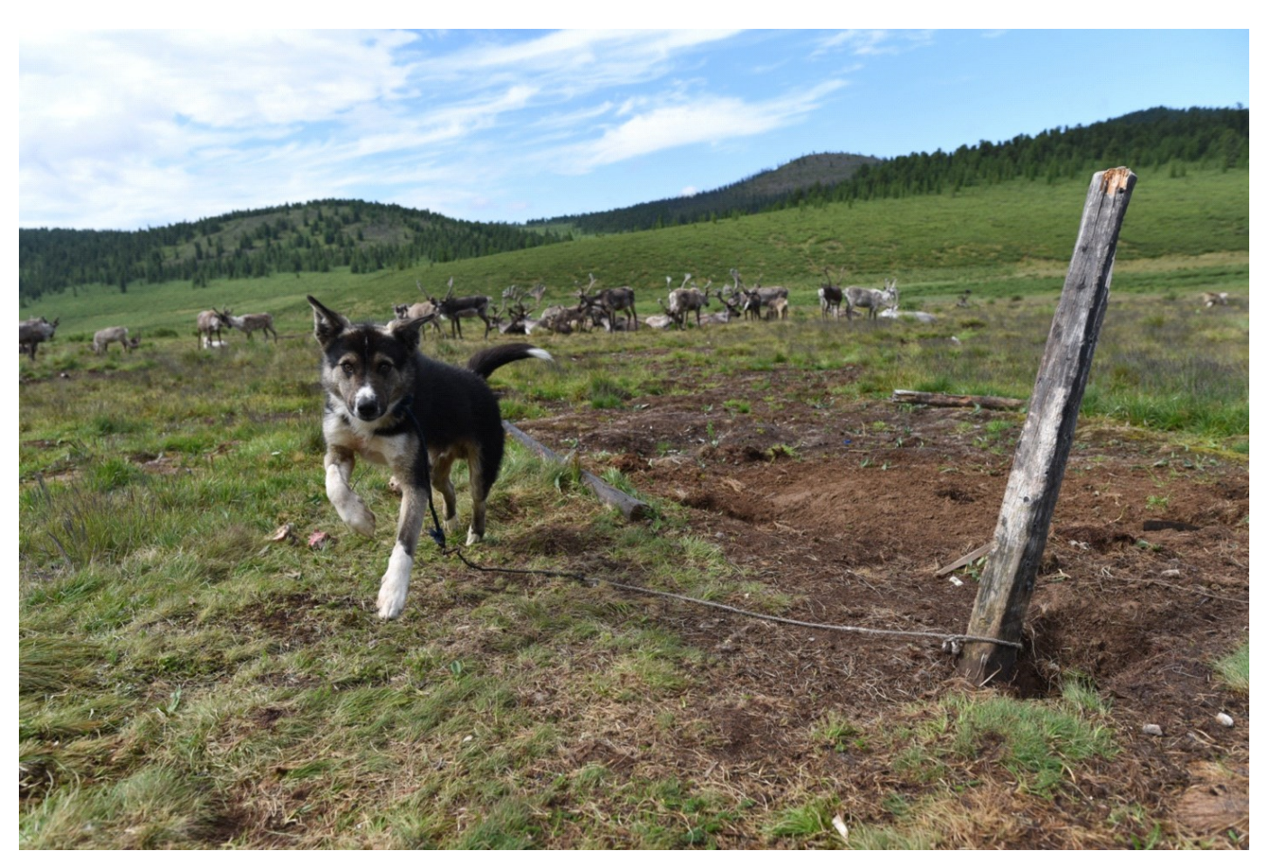
Figure 1 A nameless one-year-old Tožu hunting dog at the reindeer herders' summer campsite Aaldïg-Ažïk, Tožu, Tyva, July 3, 2019.

tethering post for horses. Human and non-human members of the multispecies aal are sensitive to the kodan's invisible borders. For instance, the dogs chase off other aal's livestock from its own kodan territory. This hints at the main responsibility of the kodanči dogs—to protect the campsite and its humans and livestock.